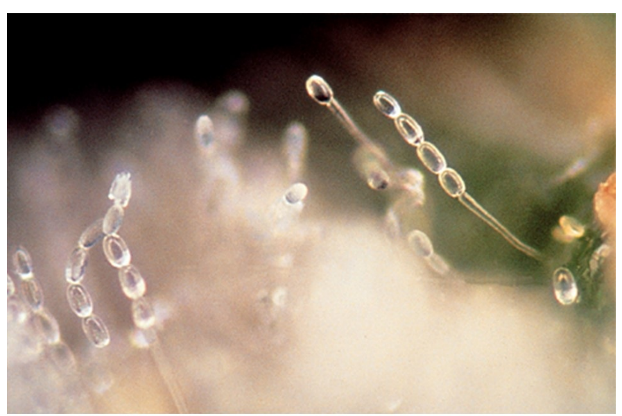
Figure 8. Conidia of the powdery mildew fungus on infected grape tissues.

(https://ag.purdue.edu/hla/hort/d ocuments/id-465.pdf).