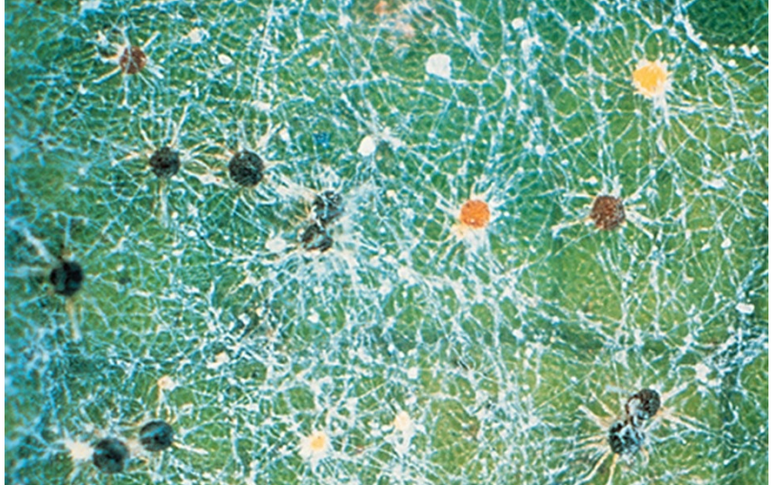
Figure 7. Cleistothecia of the powdery mildew fungus in various stage of maturity on a grape leaf.

Much of the fungicidal activity of sulfur is associated with its vapor phase. The production of vapors and their effectiveness depend on