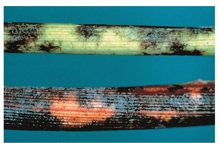
Berries are susceptible to infection Figure 3. Blackened tissue on grape shoots infected with the until their sugar content reaches about powdery mildew fungus.

continue to produce spores until the berries contain 15% sugar. If berries are infected before they attain full size, the epidermal cells are killed, and growth of the epidermis is thus prevented. As the pulp continues to expand, the berry splits from internal pressure. Split berries either dry up or rot. Berries of nonwhite cultivars that are infected as they begin to ripen fail to color properly and have a blotchy appearance at harvest (Figure 4). A netlike pattern of scar tissue develop on the surface of infected berries (Figure 5).