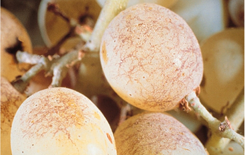
Figure 5. Netlike pattern of scar tissue on ripe grape berries infected with the powdery mildew fungus (Courtesy APS, J. Schlesselman).

development, although fungal growth can occur from 43-90°F (6-32°C). Temperatures above 95°F (35°C) inhibit germination of conidia, and above 104°F (40°C) they are killed. Free water often result in poor and abnormal germination of conidia as well as bursting of conidia. Rainfall can be detrimental to disease development by removing conidia and disrupting mycelium. Atmospheric moisture in the range of 40-100% relative humidity is sufficient for germination of conidia and infection.