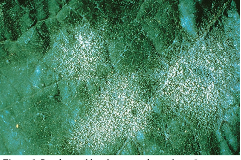
Figure 1. Powdery mildew fungus on the surface of a grape leaf eft (Courtesy APS, J. Schlesselman).

Powdery mildew is caused by the fungus Uncinula necator . This fungus was reported in North America in 1834. Powdery mildew occurs in most grape growing areas of the world. If not managed effectively on susceptible cultivars, the disease can reduce vine growth, yield, quality, and winter hardiness. Cultivars of Vitis vinifera and its hybrids (French hybrids) are generally much more susceptible to powdery mildew than are native American cultivars such a Concord.