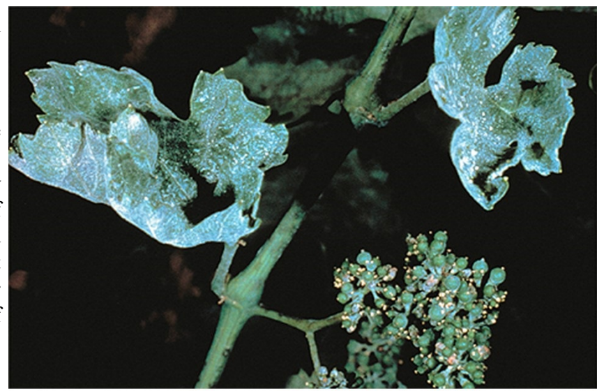
Figure 2. Distortion and stunting of young leaves of grape affected by powdery mildew.