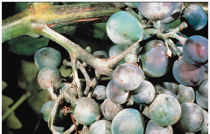
Figure 4. Blotchy ripening of grape berries infected with the powdery mildew fungus.

The powdery mildew pathogen may overwinter as hypae inside dormant buds of the grapevine, as cleistothecium on the surface of infected tissue (Figures 6 & 7), or both. Developing buds are infected during the growing season. The fungus grows into the bud, where it remains in a dormant state on the inner bud scales until the following season. Shortly afer budbreak, the fungus is reactivated and covers the emerging shoot with white mycelium. Conidia are produced abundantly on