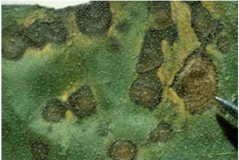
Figure 3. Close-up of Alternaria leaf spot, target-like spots (Purdue University photograph).

( http://www.btny.purdue.edu/pubs/id/id-56/ ).