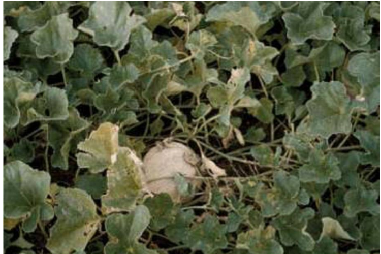
Figure 1. Alternaria leaf blight on older leaves of muskmelon plants.

Plants usually develop circular spots or lesions on the oldest crown leaves (Figure 1). The number of spots increases rapidly in warm, humid weather, later spreading to the younger leaves toward the tips of the vines (Figure 2). At first, the lesions are small, circular, and somewhat water-soaked or transparent. They enlarge rapidly until they are 1/2 inch or more in diameter, turning light brown on muskmelons (Figure 2), cucumber, and squash, and dark brown or black on watermelon when mature. Definite concentric rings may often be seen in the older, round to irregular spots, giving them a target-like appearance (Figure 3). Spots may merge, blighting large areas of the leaf. Muskmelons and cantaloupes are more susceptible than other cucurbits. The leaves commonly curl, wither, and fall prematurely. Vines may be partly or completely defoliated by harvest time. Often