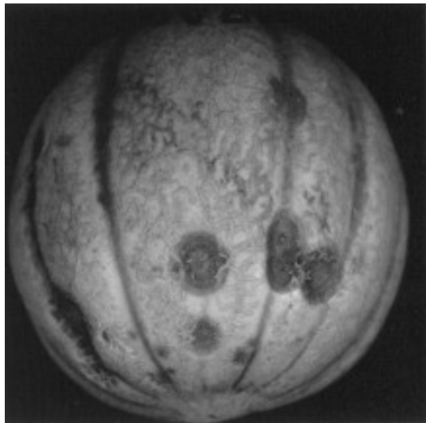
Figure 5. Anthracnose lesions on a muskmelon fruit (Purdue University photo).