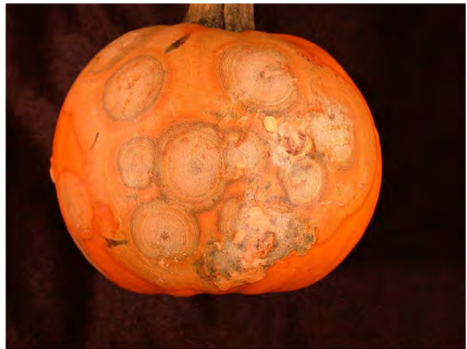
Figure 4. Anthracnose lesions on a pumpkin fruit.