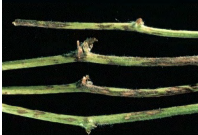
Figure 3. Anthracnose lesions on watermelon stems.

The Colletotrichum fungus overwinters in refuse from a previous vine crop or in weeds of the Cucurbitaceae family. It may be seed-borne and is also transmitted by cucumber beetles. Frequent rains accompanied by surface drainage water and temperatures around 75°F (24°C) favor the spread and buildup of the fungus. It may also be carried by workers. The fungus can penetrate leaves directly and does not require natural openings (e.g., stomates) or wounds. Initial infection requires a period of 100 percent relative humidity for 24 hours and a temperature of 68 to 75°F (20° to 24°C). Symptoms can appear within 6 days after infection has taken place. Spore-bearing structures (acervuli) break through the host surface (Figure 6) and produce tremendous numbers of one-celled, colorless spores (conidia) which exude from the acervuli in