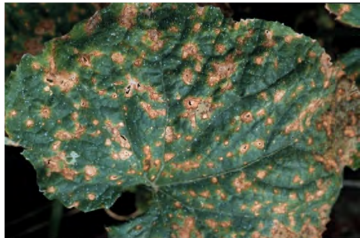
Figure 1. Leaf spots on a cucumber leaf, caused by the Anthracnose fungus.

All aboveground plant parts may become infected. Leaves first show small, pale yellow or water-soaked areas that enlarge rapidly and turn to tan to dark brown (most cucurbits) (Figure 1) or irregular and black (watermelon) (Figure 2). The spots or lesions may merge blighting large areas of the leaves, and in severe cases whole leaves may die. Wind-blown commonly tears the dry, dead centers of the spots, leaving the foliage ragged. Tan to black lesions, which form on muskmelon and watermelon petioles and stems, become elongated and slightly sunken (Figure 3). Defoliation and killing of infected vines are common on muskmelon.